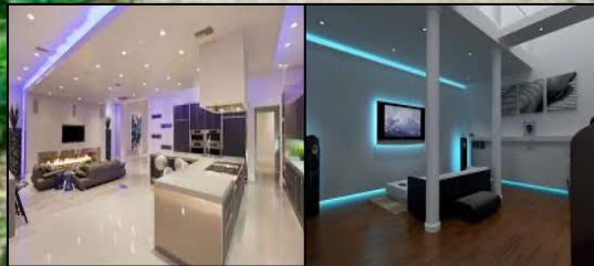
Led Lighting: This type of illumination provides a welcoming and warm environment, in order to appeal aesthetically pleasing, and also provides an excellent lighting for internal buildings.