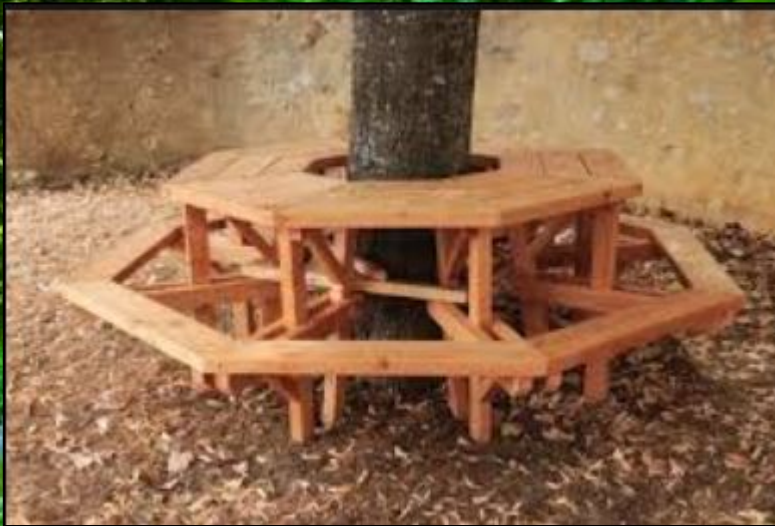
Tree Chair/bench: This is to create a tree covered area where people can chill out and play card games and even eat lunch if they want to eat their lunch outside with their friends with a nice wind breeze, making them enjoy the natural environment at the same time.