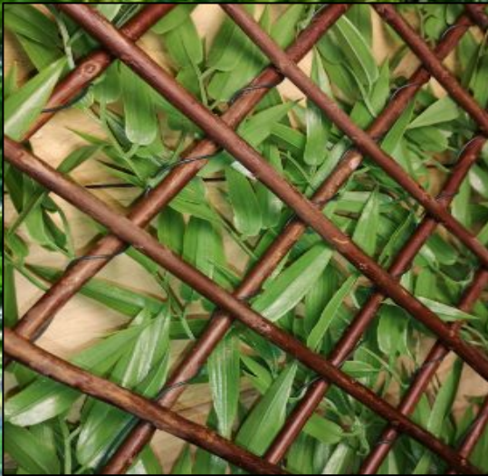
A Bamboo and leaf screen: To cover up the garden from the astroturf and the people on the outside to keep part of the garden/chill out space hidden.