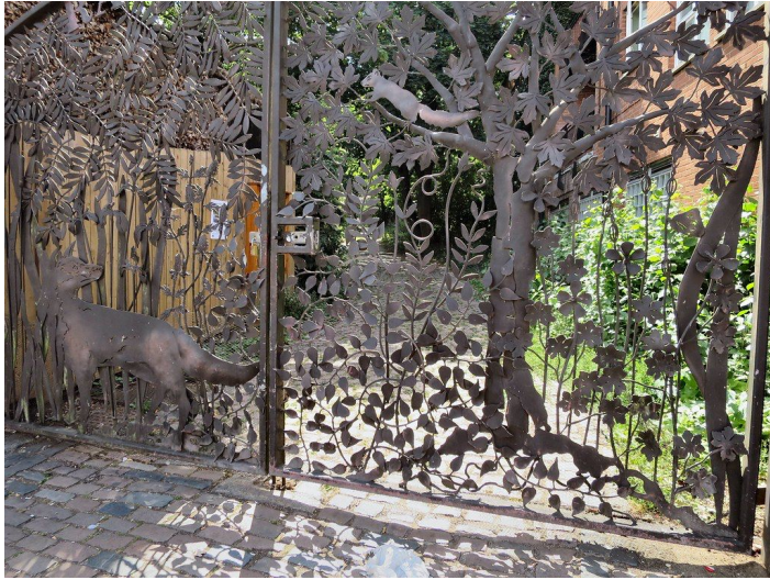
Railway Fields Local Nature Reserve.